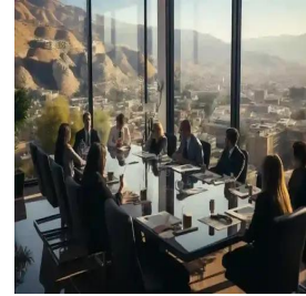
Amman - Jordan