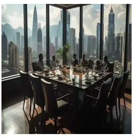
Kuala Lumpur -Malaysia