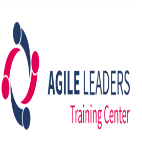
Cape town - South Africa