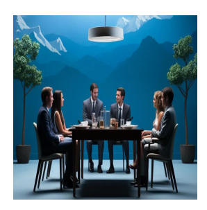
Human Resources Training and Development Courses