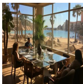
Sharm El-Sheikh - Egypt