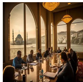
Istanbul - Turkey