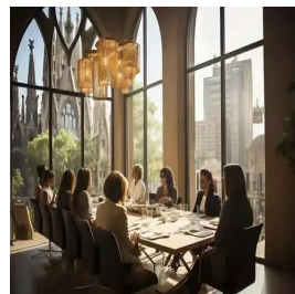
Barcelona - Spain