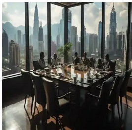
Kuala Lumpur - Malaysia