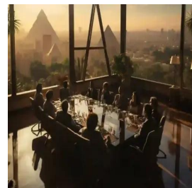
Cairo - Egypt