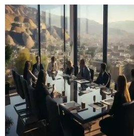
Tbilisi - Georgia