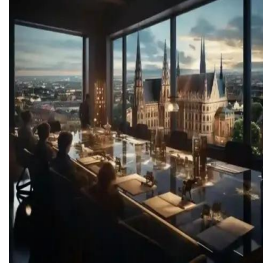
Vienna - Austria