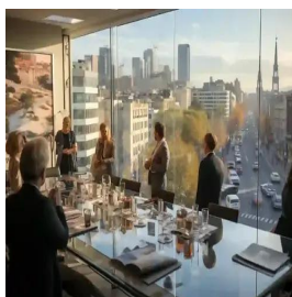
Madrid - Spain