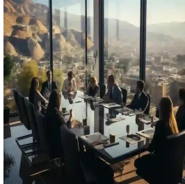
Amman - Jordan