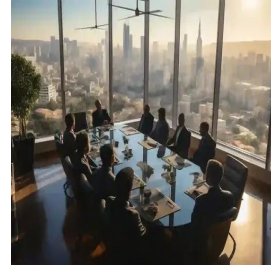
Baku - Azerbaijan