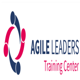
Cape town - South Africa