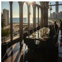
Casablanca - Morocco