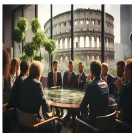
Rome - Italy