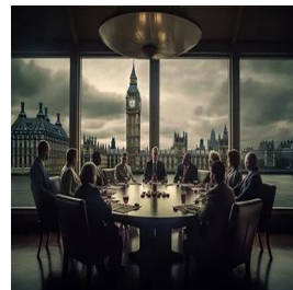
London - UK