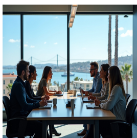
San Diego - USA