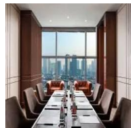
Jakarta - Indonesia