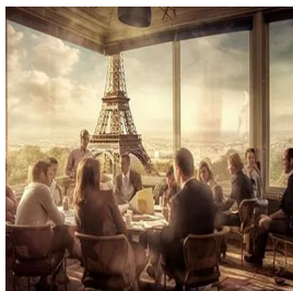
Paris - France