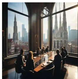
Milan - Italy