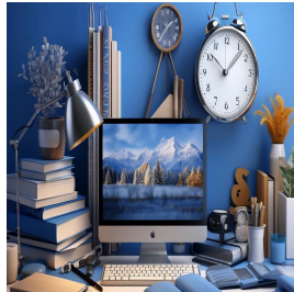
Secretarial and Administration Training Courses