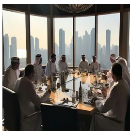
Manama - Bahrain