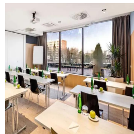
Prague - Czech Republic