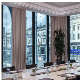
Geneva - Switzerland