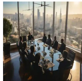
Baku - Azerbaijan