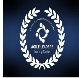
Certified Courses By International Bodies