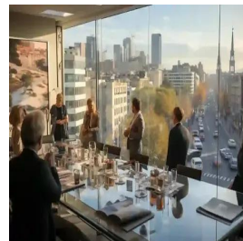
Madrid - Spain