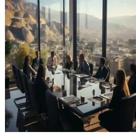
Amman - Jordan