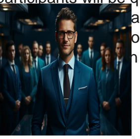
Leadership and Management Training Courses