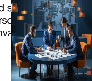
Legal Training, Procurement and Contracting Courses