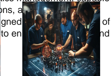
Maintenance Training and Engineering Training Courses