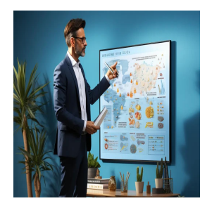
Marketing, Customer Relations, and Sales Courses