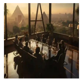
Cairo - Egypt