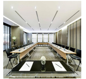
Bangkok - Thailand