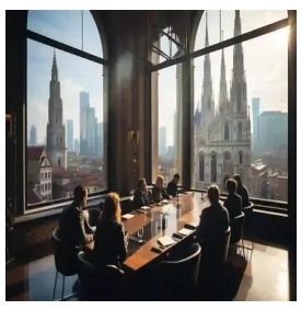
Milan - Italy