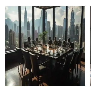
Kuala Lumpur -Malaysia