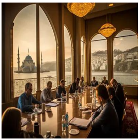
Istanbul - Turkey