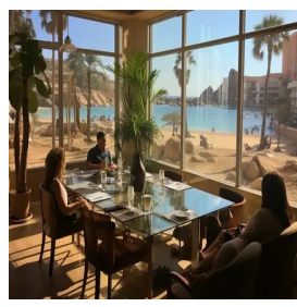
Sharm El-Sheikh -Egypt