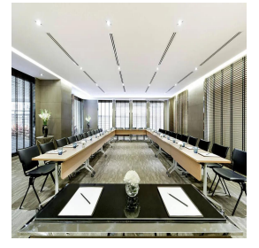
Nairobi - Kenya