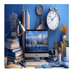
Secretarial and Administration Training Courses