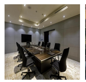
Accra - Ghana