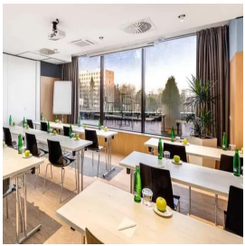
Prague - Czech Republic