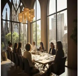
Barcelona - Spain