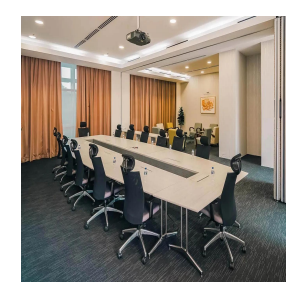
Phuket - Thailand