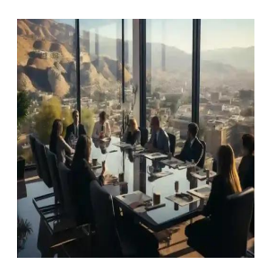
Tbilisi - Georgia