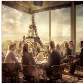
Paris - France