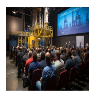
Oil & Gas Training and Other Technical Courses