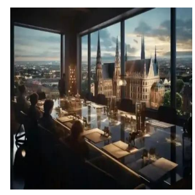
Vienna - Austria