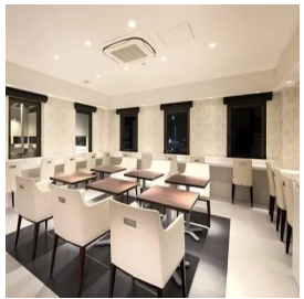
Tokyo - Japan