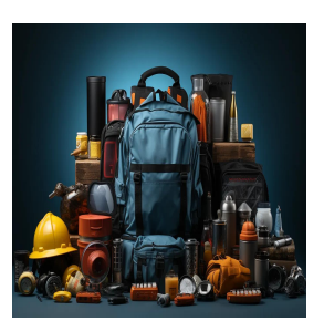
Occupational Health, Safety and Security Training Courses