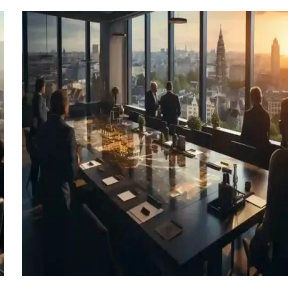
Amsterdam - Netherlands