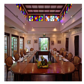
Zanzibar - Tanzania