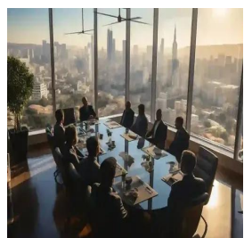
Baku - Azerbaijan