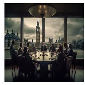
London - UK