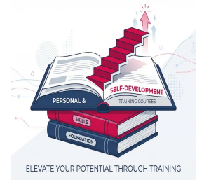
Personal & Self- Development Training Courses