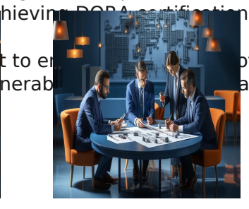
Legal Training, Procurement and Contracting Courses