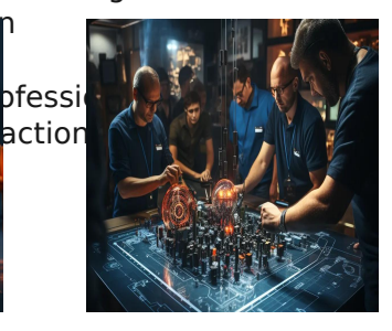
Maintenance Training and Engineering Training Courses