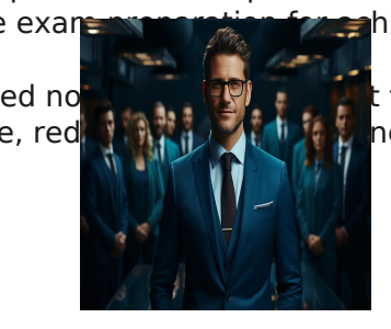
Leadership and Management Training Courses