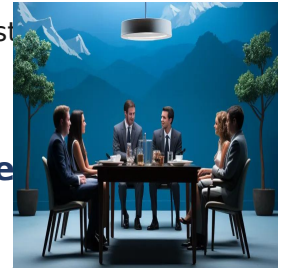
Human Resources Training and Development Courses

Each day's session lasts approximately 4-5 hours, totaling 20-25 hours for the full course.