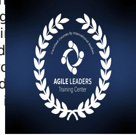
Certified Courses By International Bodies