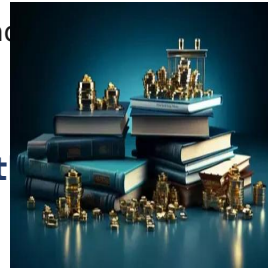
Governance, Risk and Compliance Training Courses