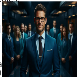
Leadership and Management Training Courses