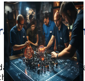
Maintenance Training and Engineering Training Courses

The course covers a wide range of topics, including digital marketing, data analytics, and artificial intelligence. It is designed to provide participants with the knowledge and skills needed to drive digital transformation in their industries. Participants will leave with not just knowledge but actionable skills to drive applications in risk management, cybersecurity, and machine learning for customer experience enhancement. Participants will leave with not just knowledge but actionable skills to drive transformation in their industries.