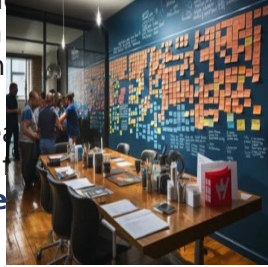
Agile PM and Project Management Training Courses