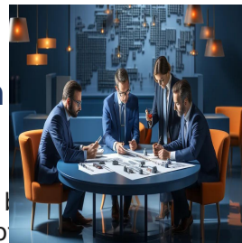
Legal Training, Procurement and Contracting Courses