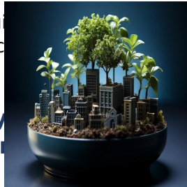
Environment & Sustainability Training Courses