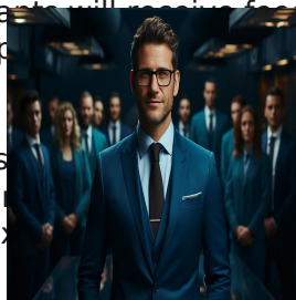
Leadership and Management Training Courses