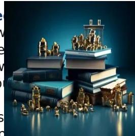
Governance, Risk and Compliance Training Courses