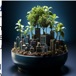
Environment & Sustainability Training Courses