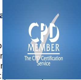
Certified Courses By International Bodies