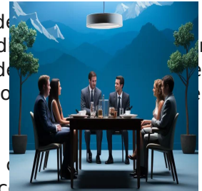
Human Resources Training and Development Courses