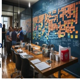
Agile PM and Project Management Training