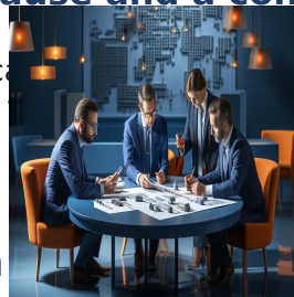
Legal Training, Procurement and Contracting Courses