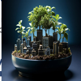
Environment & Sustainability Training Courses