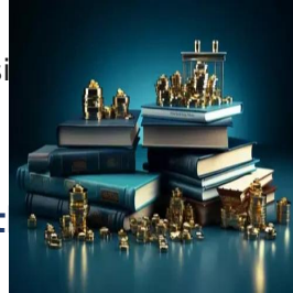
Governance, Risk and Compliance Training Courses