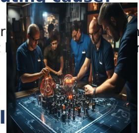
Maintenance Training and Engineering Training Courses

Unlike general safety training, this course is deeply analytical and grounded in real-world applications. It provides a structured framework for conducting root cause analysis for HSE professionals and is built around the Root Cause Map Guidance, a recognized standard in many high-risk industries. It focuses on effective RCA methodologies that go beyond surface-level fixes, providing the structure and confidence to uncover deep, systemic issues. The integration of tools like fault trees, cause mapping, and structured investigation protocols ensures that participants walk away with risk-based problem-solving skills that are immediately applicable. Moreover, the course promotes cross-departmental collaboration between safety, operations, engineering, and compliance, helping to embed a robust safety culture and reduce future incidents across the organization.