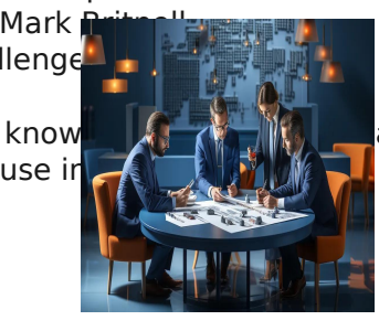
Legal Training, Procurement and Contracting Courses