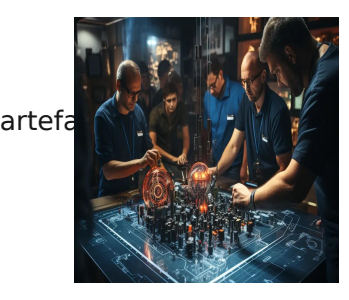
Maintenance Training and Engineering Training Courses