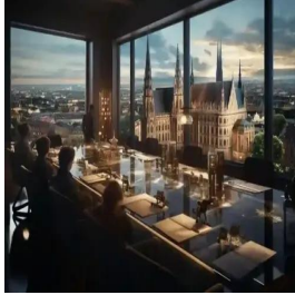
Vienna - Austria