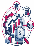
Finance and Accounting Training Courses