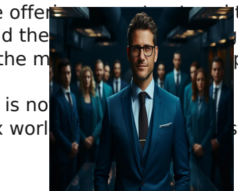
Leadership and Management Training Courses