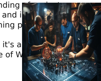
Maintenance Training and Engineering Training Courses