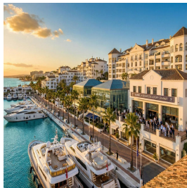
Marbella - Spain