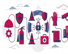
Occupational Health, Safety and Security Training Courses