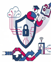
IT Security Training & IT Training Courses