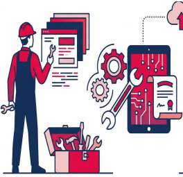
Maintenance Training and Engineering Training Courses