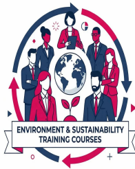
Environment & Sustainability Training Courses