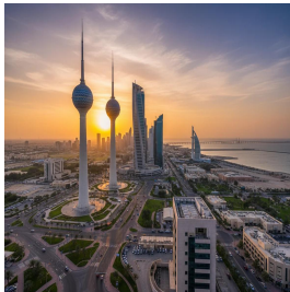
Kuwait - Kuwait