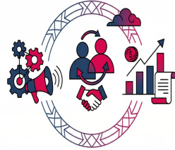
Marketing, Customer Relations, and Sales Courses