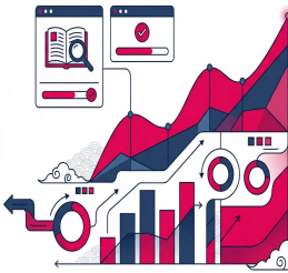
Data Analytics Training and Data Science Courses