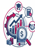
Finance and Accounting Training Courses