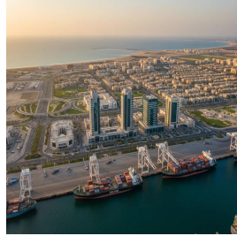
Al Jubail - Saudi Arabia