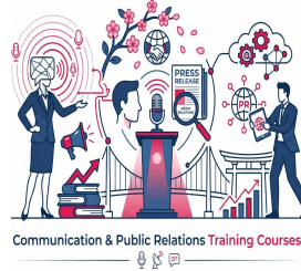
Communication and Public Relations Training Courses