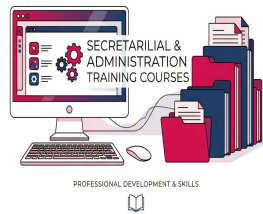
Secretarial and Administration Training Courses