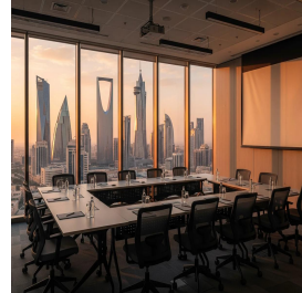
Riyadh - Saudi Arabia