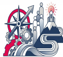
Leadership and Management Training Courses