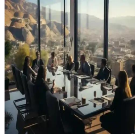
Amman - Jordan