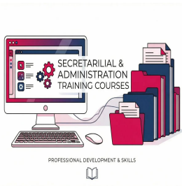
Secretarial and Administration Training Courses