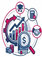
Finance and Accounting Training Courses