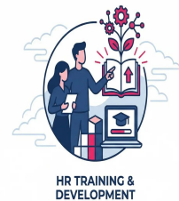
Human Resources Training and Development Courses