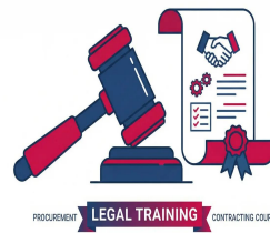
Legal Training, Procurement and Contracting Courses