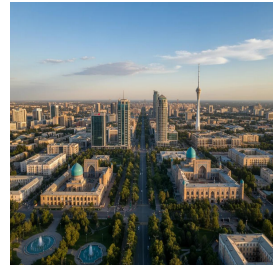
Tashkent - Uzbekistan