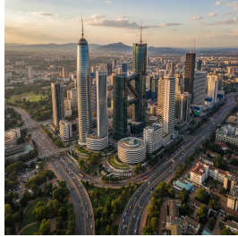
Nairobi - Kenya