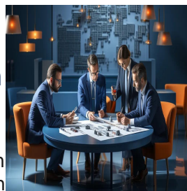
Legal Training, Procurement and Contracting Courses