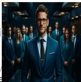
Leadership and Management Training Courses