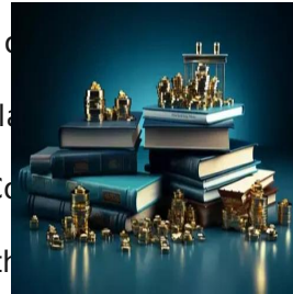
Governance, Risk and Compliance Training Courses