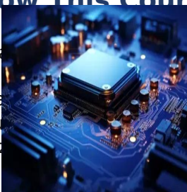
IT Security Training & IT Training Courses