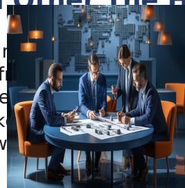
Legal Training, Procurement and Contracting Courses